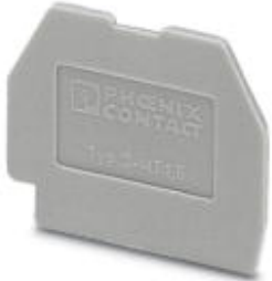
End cover, Length: 22 mm, Width: 1 mm, Height: 17.7 mm, Color: gray

Please be informed that the data shown in this PDF Document is generated from our Online Catalog. Please find the complete data in the user's documentation. Our General Terms of Use for Downloads are valid ( http://phoenixcontact.com/download )