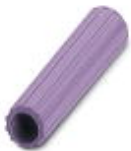
Insulating sleeve, Color: violet