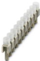
Fixed bridge, Pitch: 10.2 mm, Number of positions: 10, Color: silver

Please be informed that the data shown in this PDF Document is generated from our Online Catalog. Please find the complete data in the user's documentation. Our General Terms of Use for Downloads are valid ( http://phoenixcontact.com/download )