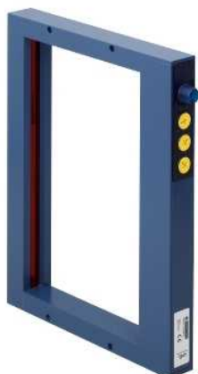
photo-electric sensor - XUV - frame - 200X120mm - 12..24VDC - M12