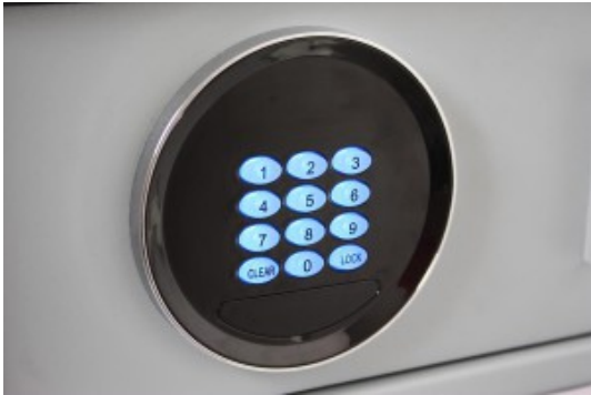
Euro Vault - Illuminated Keypad