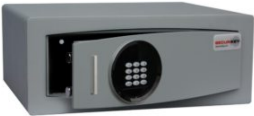
Euro Vault Electronic