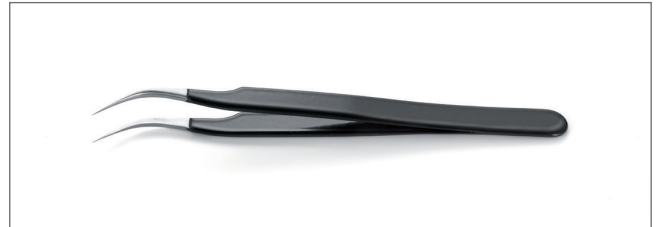
DT000011 Tips: fine, curved. OAL: 120mm