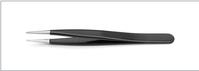
DT000005 Tips: straight, strong, thick. OAL: 120mm