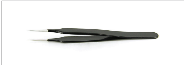
DT000009 Tips: straight, fine. OAL: 110mm