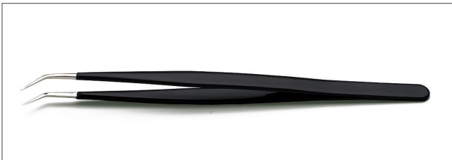
DT000027 Tips: bent, fine. OAL: 155mm