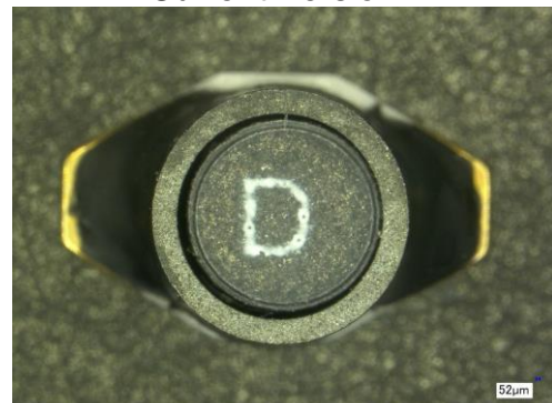
Marking with Pad-Printing