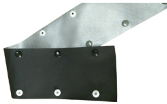
Reversible - Grey on one side and Black on the other