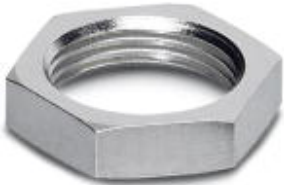
Flat nut with M8 thread

Please be informed that the data shown in this PDF Document is generated from our Online Catalog. Please find the complete data in the user's documentation. Our General Terms of Use for Downloads are valid ( http://phoenixcontact.com/download )