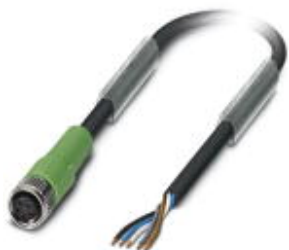
Sensor/Actuator cable, 5-position, PUR, black-gray RAL 7021, free cable end, on Socket straight M8, B-coded, Cable length: 5 m

Please be informed that the data shown in this PDF Document is generated from our Online Catalog. Please find the complete data in the user's documentation. Our General Terms of Use for Downloads are valid ( http://phoenixcontact.com/download )