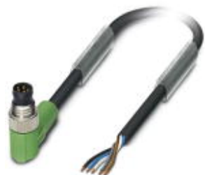
Sensor/Actuator cable, 5-position, PUR, black-gray RAL 7021, Plug angled M8, B-coded, on free cable end, Cable length: 10 m

Please be informed that the data shown in this PDF Document is generated from our Online Catalog. Please find the complete data in the user's documentation. Our General Terms of Use for Downloads are valid ( http://phoenixcontact.com/download )