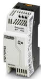
Primary-switched STEP POWER power supply for DIN rail mounting, input: 1-phase, output: 12 V DC/1.5 A

Please be informed that the data shown in this PDF Document is generated from our Online Catalog. Please find the complete data in the user's documentation. Our General Terms of Use for Downloads are valid ( http://phoenixcontact.com/download )