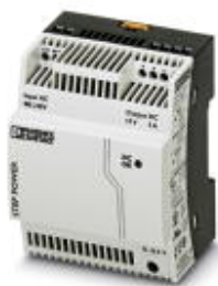
Primary-switched STEP POWER power supply for DIN rail mounting, input: 1-phase, output: 12 V DC/5 A

Please be informed that the data shown in this PDF Document is generated from our Online Catalog. Please find the complete data in the user's documentation. Our General Terms of Use for Downloads are valid ( http://phoenixcontact.com/download )