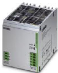
Primary-switched TRIO POWER power supply for DIN rail mounting, input: 1-phase, output: 48 V DC/10 A

Please be informed that the data shown in this PDF Document is generated from our Online Catalog. Please find the complete data in the user's documentation. Our General Terms of Use for Downloads are valid ( http://phoenixcontact.com/download )