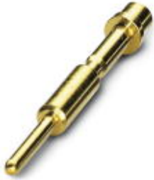
Crimp contact, turned, Single contact, Contact diameter: 1 mm, Crimp range: 0.06 mm 2 ...0.25 mm 2

Please be informed that the data shown in this PDF Document is generated from our Online Catalog. Please find the complete data in the user's documentation. Our General Terms of Use for Downloads are valid ( http://phoenixcontact.com/download )