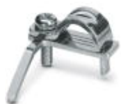
Shield connection clip for printed circuit terminal block

Components of electronic housing - ME-SAS MINI - 2200456