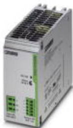
Primary-switched TRIO POWER power supply for DIN rail mounting, input: 1-phase, output: 48 V DC/5 A

Please be informed that the data shown in this PDF Document is generated from our Online Catalog. Please find the complete data in the user's documentation. Our General Terms of Use for Downloads are valid ( http://phoenixcontact.com/download )