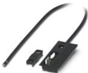
Photovoltaic connection element, Nominal current: 15 A, Nom. voltage: 1000 V, Width: 40.4 mm, Connection type: open cable end, Color: black

Please be informed that the data shown in this PDF Document is generated from our Online Catalog. Please find the complete data in the user's documentation. Our General Terms of Use for Downloads are valid ( http://phoenixcontact.com/download )