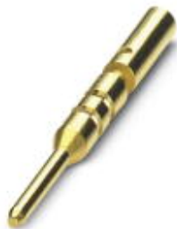
Crimp contact, turned, Contact diameter: 0.8 mm, Crimp range: 0.08 mm²...0.25 mm²

Please be informed that the data shown in this PDF Document is generated from our Online Catalog. Please find the complete data in the user's documentation. Our General Terms of Use for Downloads are valid ( http://phoenixcontact.com/download )