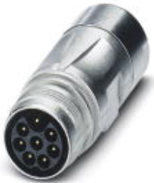
Coupler connector, straight, SPEEDCON locking, M17, Number of positions: 5+3+PE, Type of contact: Male connector, Crimp connection, shielded: yes, Cable diameter: 9 mm...11.2 mm

Please be informed that the data shown in this PDF Document is generated from our Online Catalog. Please find the complete data in the user's documentation. Our General Terms of Use for Downloads are valid ( http://phoenixcontact.com/download )