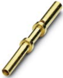
Crimp contact, turned, Contact diameter: 0.6 mm, Crimp range: 0.34 mm 2 ...0.5 mm 2

Please be informed that the data shown in this PDF Document is generated from our Online Catalog. Please find the complete data in the user's documentation. Our General Terms of Use for Downloads are valid ( http://phoenixcontact.com/download )