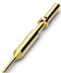
Crimp contact, turned, Contact diameter: 0.6 mm, Crimp range: 0.34 mm 2 ...0.5 mm 2

Please be informed that the data shown in this PDF Document is generated from our Online Catalog. Please find the complete data in the user's documentation. Our General Terms of Use for Downloads are valid ( http://phoenixcontact.com/download )