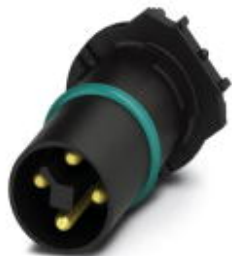
Flush-type connector, Power, 4-position, PlugLink:straight, T power, PCB mounting, THR solder connection

Please be informed that the data shown in this PDF Document is generated from our Online Catalog. Please find the complete data in the user's documentation. Our General Terms of Use for Downloads are valid ( http://phoenixcontact.com/download )