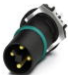
Sample set, Universal, 4-position, PlugLink:straightLink:M12, T power, PCB mounting, THR solder connection

Sample set - SACC-CI-M12MST-4CON-L180THR SH SP - 1420413