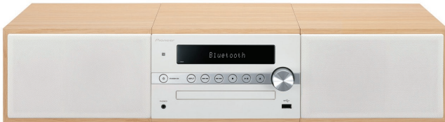
X-CM56(W) Horizontal speaker setup