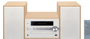
Vertical speaker setup