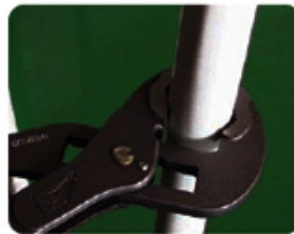
3. Tightening of a pipe