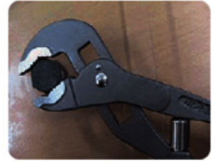
4. Tightening of a bolt