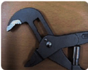
1. Jaw is open