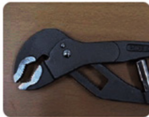
2. Jaw is closed