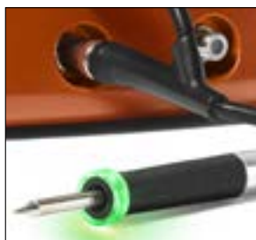
LED equipped hand piece signals to operator when a good solder joint is formed.