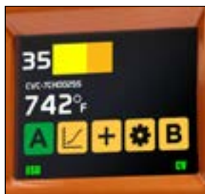
Tip temperature displayed on large color screen.