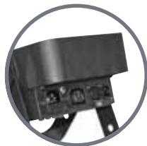
Side entry XLR & power connections