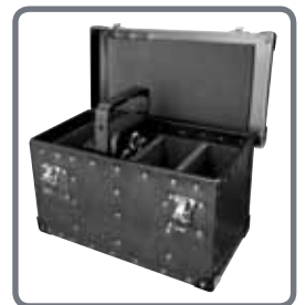
Optional Quad Case Order ref: CASE71