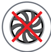
Convection cooled, no fan!