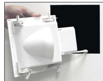
45-0031-WH - Back View