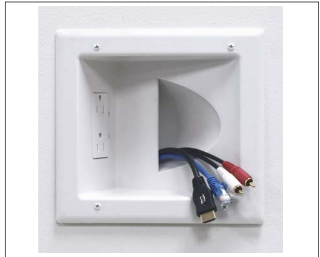
45-0031-WH - Front View