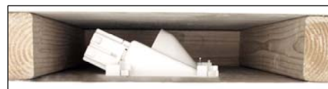
Top View of 45-0031-WH Mounted Between Studs