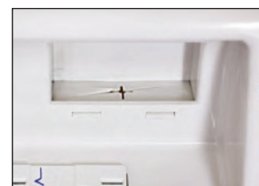
Flexible Screen closes interior opening of the Mid-Size Plate and Straight Blade Inlet