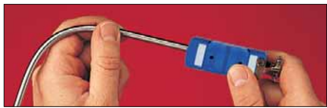
Made from Special Limits of Error OMEGACLAD® wire. Probes can be bent to between 2 and 3 times the diameter

The OMEGA® quick disconnect molded thermocouple assemblies are available with sheath diameters of 1.5, 3, 4.5 and 6 mm (1/16, 1/8, 3/16 and 1/4") in standard 300, 450 and 600 mm (12, 18 and 24") nominal lengths. Custom lengths are also available, consult sales for details.