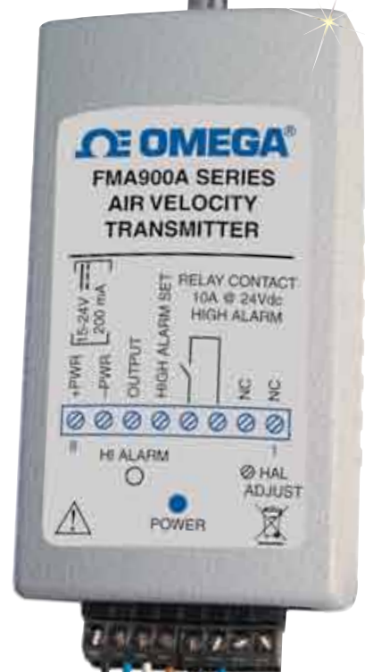
FMA901A-V1 shown actual size.