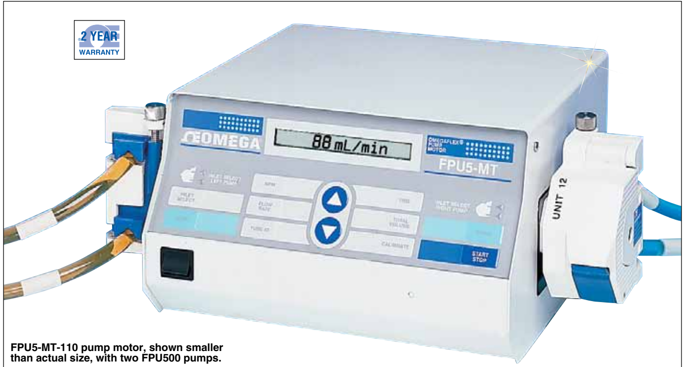
FPU5-MT-110 pump motor, shown smaller than actual size, with two FPU500 pumps.