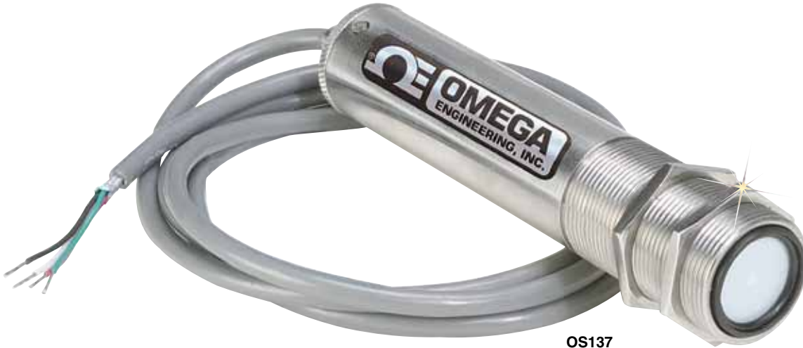
OS137 shown smaller than actual size.