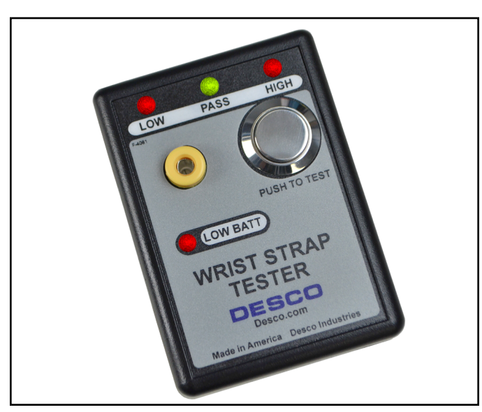
Figure 1. Desco 19240 Wrist Strap Tester