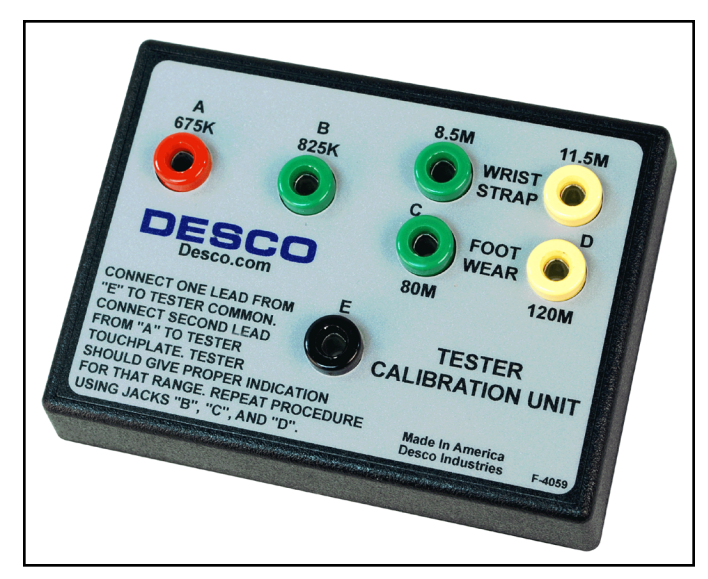
Figure 3. Desco <u>07010</u> Calibration Unit

View technical bulletin TB-2039 for more information on the 07010 Calibration Unit and instructions to calibrate the Wrist Strap Tester.