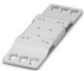
Universal wall adapter for securely mounting the power supply in the event of strong vibrations. The power supply is screwed directly onto the mounting surface. The universal wall adapter is attached at the top/bottom.

Assembly adapters - UWA 182/52 - 2938235