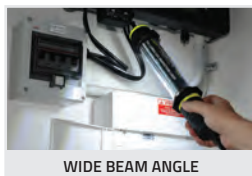
WIDE BEAM ANGLE