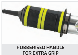
RUBBERISED HANDLE FOR EXTRA GRIP