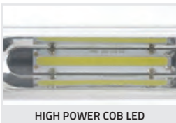
HIGH POWER COB LED