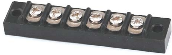
(6 Pole shown)