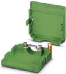
Cable housing, pitch: 3.81 mm, number of positions: 12, dimension a: 48.11 mm, color: green

Please be informed that the data shown in this PDF Document is generated from our Online Catalog. Please find the complete data in the user's documentation. Our General Terms of Use for Downloads are valid ( http://phoenixcontact.com/download )