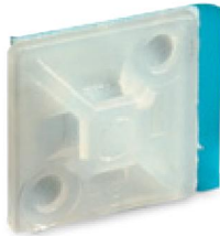
Hole for #6 screw