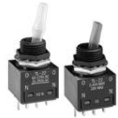
LED Specification Revisions for TL Series

The TL Series Illuminated Toggles will have changes to the LED specifications for Bright Red (code C) and Bright Amber (code D) LEDs. The changes will effect all of the switches, including both actuators lengths, and standard and custom devices. The specification revisions are outlined below, followed by effected standard part numbers.