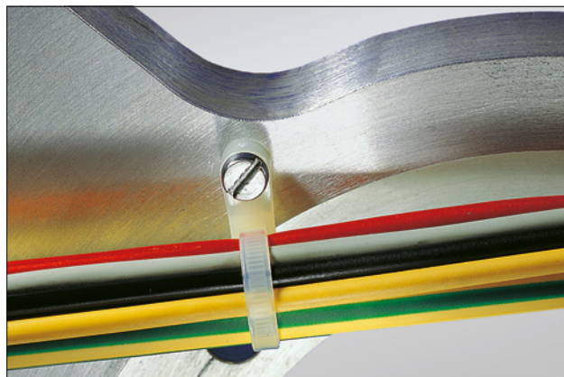
The mounting head ties can be easily screwed onto a panel.