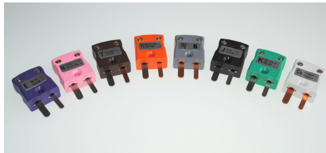
'Thermocouple connector with flat pins'