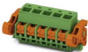
The figure shows a 5-position version

Plug component, nominal current: 12 A, rated voltage (III/2): 320 V, number of positions: 4, pitch: 5.08 mm, connection method: Push-in spring connection, Color: green, contact surface: Tin