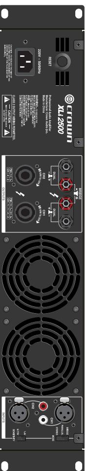
XLi 2500 model shown