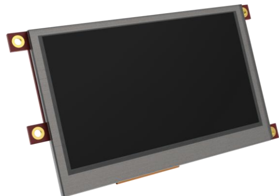
The uLCD-43PT Display Module