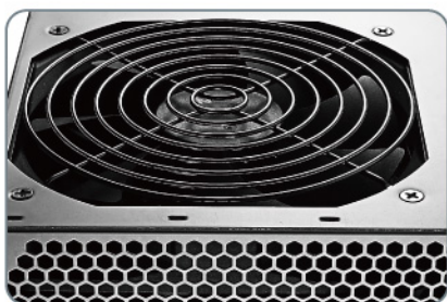
intelligent 120mm fan speed controller