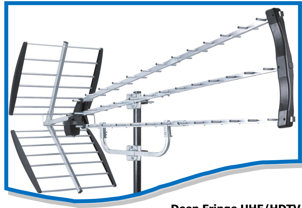
Deep Fringe UHF/HDTV

A Return Material Authorization (RMA) is required prior to returning any product to Stellar Labs® under this warranty policy. Please call our Customer Service at (877) 626-3532 or send an email to customerservice@mcmelectronics.com to obtain an RMA number. Enclose the product in a prepaid package and write the RMA number in large, clear numbers on the outside of the package. To avoid confusion or misunderstanding, a shipment(s) without an RMA number(s) or an unauthorized return(s) will be refused and returned to Customer freight collect.