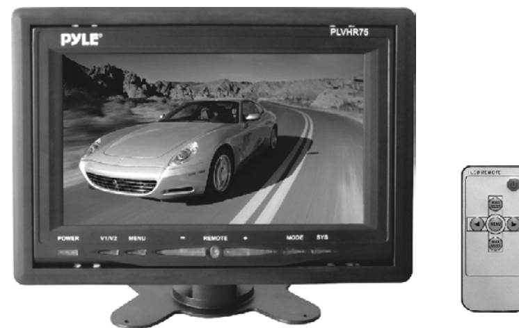
7" Widescreen TFT/LCD Video Monitor w/Headrest Shroud and Stand