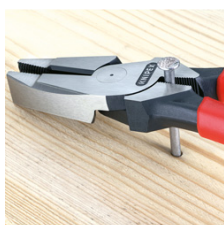
Gripping zone below the joint for powerful leverage