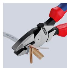
Long cutting edges for cutting flat cables