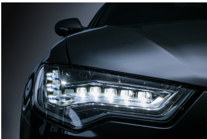
Figure 1. LED-Powered Car Headlight

LEDs are becoming very popular in automotive exterior lighting, thanks to their superior lighting characteristics, efficiency, and flexibility in design implementation. They can be used in a variety of light shapes and with different features. The required multiplicity of LED configurations in automotive exterior lighting, combined with the variability of the car battery voltage, forces the use of a large number of integrated circuits, each tailored to a specific vehicle lighting function. This article introduces a flexible controller IC that supports many architectures and greatly simplifies automotive exterior lighting design.